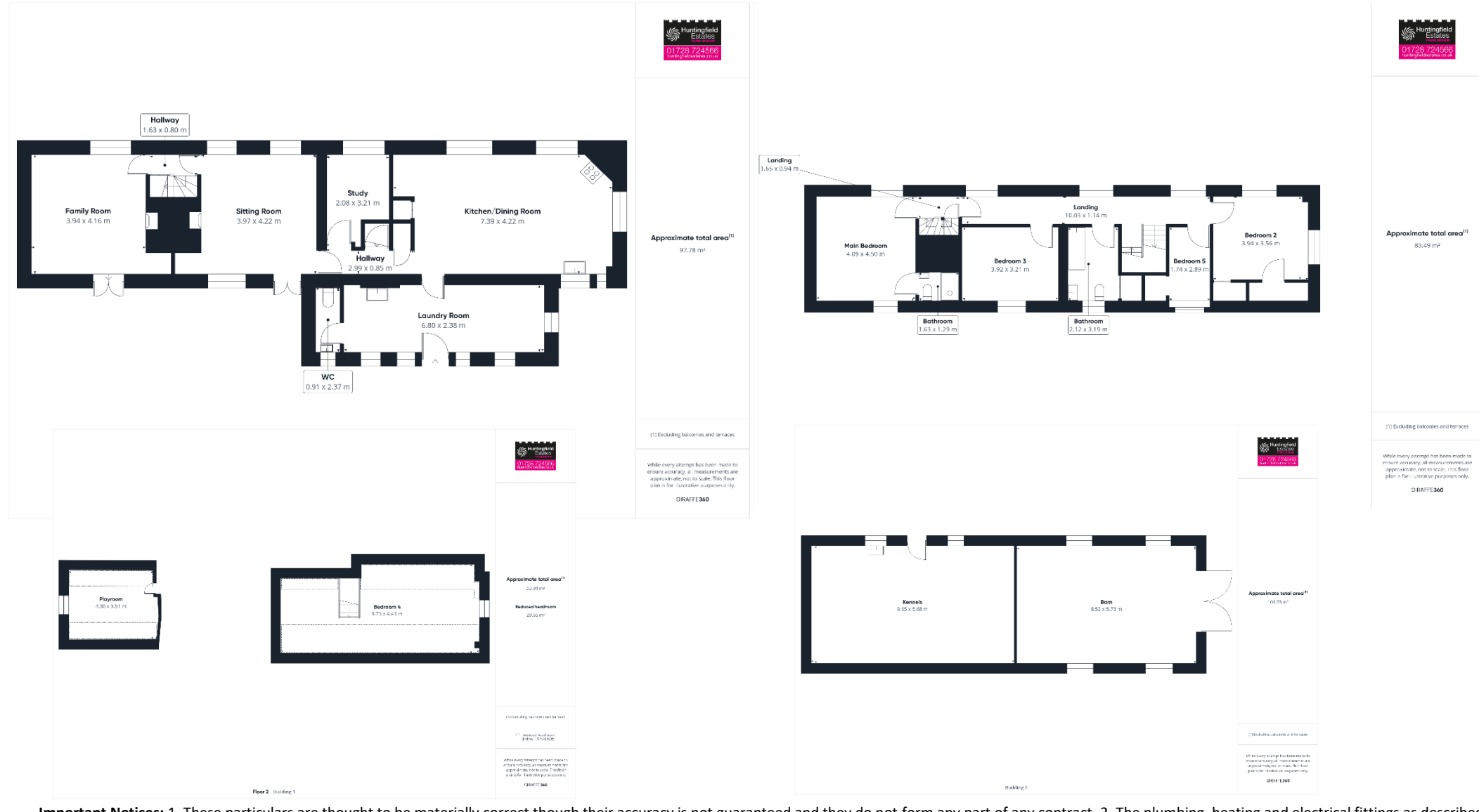
Important Notices: 1. These particulars are thought to be materially correct though their accuracy is not guaranteed and they do not form any part of any contract. 2. The plumbing, heating and electrical fittings as described have not been tested (unless stated) and no assurances can be given as to their condition or suitability. 3. The floor plans are for illustration purposes and not to scale.